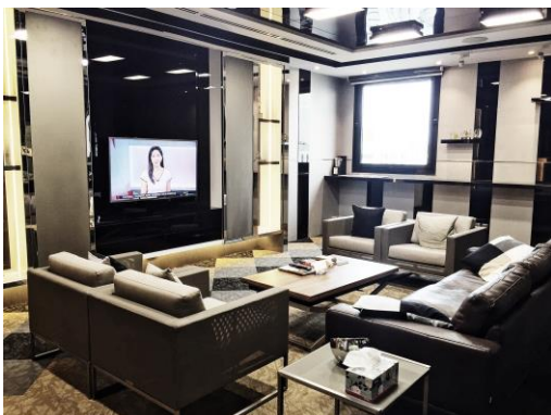
THE PINNACLE CLUB LOUNGE