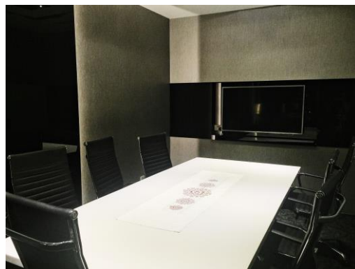
MEETING ROOM FACILITIES