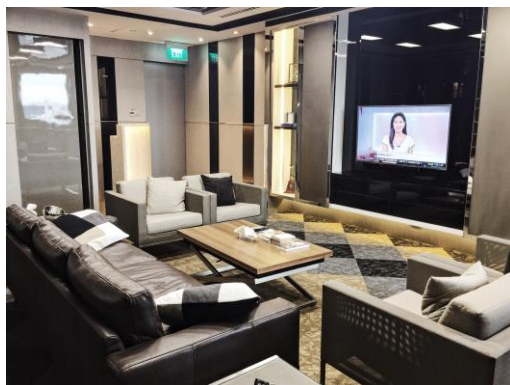
THE PINNACLE CLUB LOUNGE

Members of the Pinnacle Club have privileged access to use the lounge facilities, located at our offices in Ngee Ann City, Singapore to enjoy amenities such as beverages, meeting room and Internet access, with compliments from the Secretariat of the Pinnacle Club. The lounge design and ambience will provide members with a comfortable setting to rest, relax and do work in the heart of Orchard Road. Members of your family are also welcome.