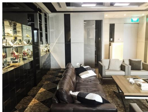
THE PINNACLE CLUB LOUNGE

Happy New Year 2016 to members of the Pinnacle Club! Welcome to our inaugural issue of the Pinnacle Club Newsletter. In this issue, we will be highlighting key updates and events that are happening around the region, starting with the launch of the Pinnacle Club lounge in Singapore.